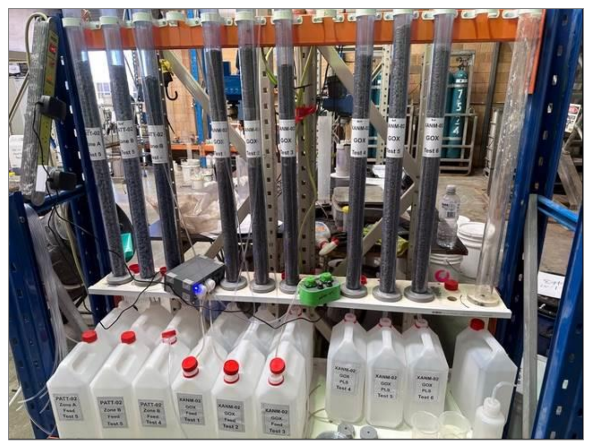
Figure 1. Oxide Column Leach at DMPS Labs

Follow up testwork was then conducted ( Figure 1 ); this involved crushing to three different particle sizes of 3mm, 6mm and 12mm. Results after 8 weeks are shown in Table 3 , with the switch from one lixiviant to the other occurring after week 6.