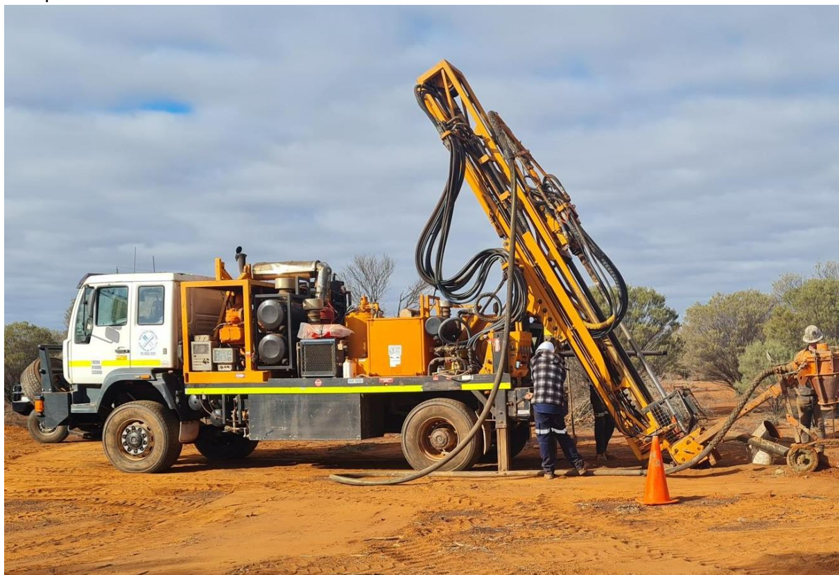
Figure 1: Bostech drilling at Kookynie Gold Project