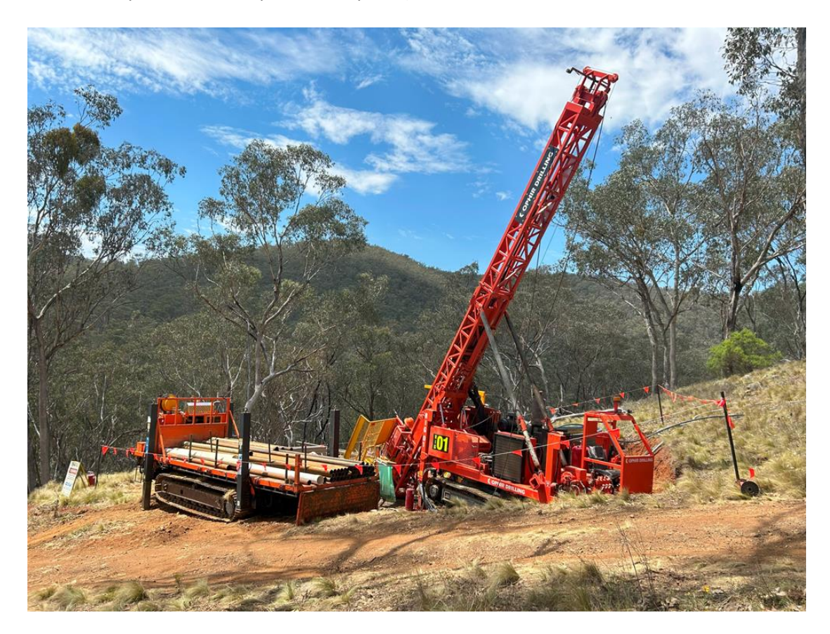
Figure 1: Diamond drilling at the Queenslander Deposit December 2023

The initial staged program will comprise 4 diamond holes for around 500m and is planned to follow-up on significant gold mineralisation intersected at the Queenslander deposit in Reverse Circulation drilling undertaken by MinRex in 2021 (ASX Announcement 24 January 2022, High Grade Gold Drilling Results Intersected at Queenslander Gold Mine). Regulatory approval has been received allowing for up to 8 diamond drill holes for a total of 1,200 metres to completed at the Queenslander deposit (ASX Announcement 1 December 2023, Exploration and Operations Update).