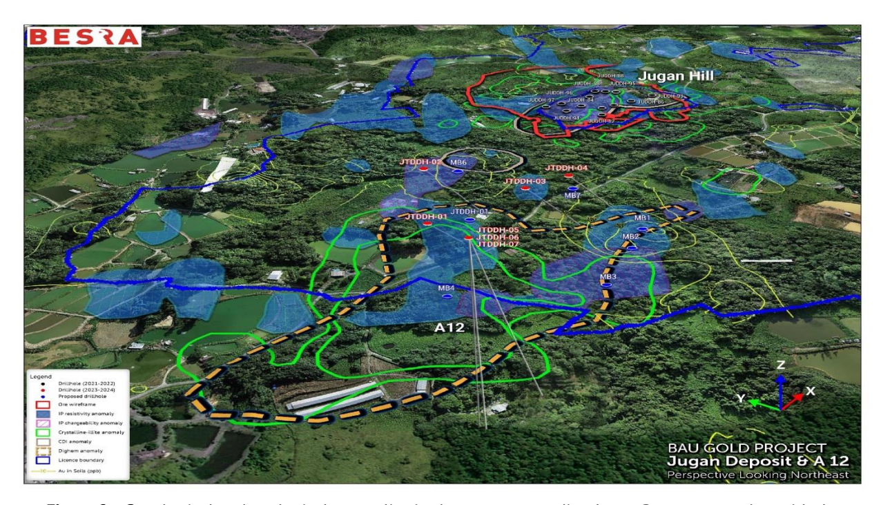
Figure 2 - Geophysical and geological anomalies in the area surrounding Jugan Prospect together with the locations of JTDDH-101 to 107.

Exploration drilling activities continued in the Quarter consisting of diamond core holes JTDDH 105 & 106 which were completed and core samples sent for assay (Figure 2).