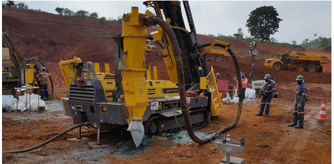
Remotely operated grade control rig on the pit bench floor

Within the orebody high grade gold zones are also becoming more apparent, adding to confidence and showing the potential for upside.