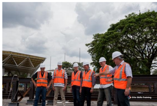
Investors Inspecting the foundation works of SLPP