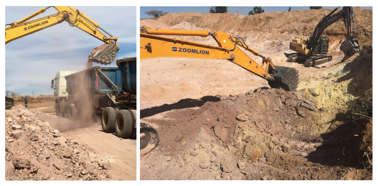
Figure 2. Trucks being loaded with ore