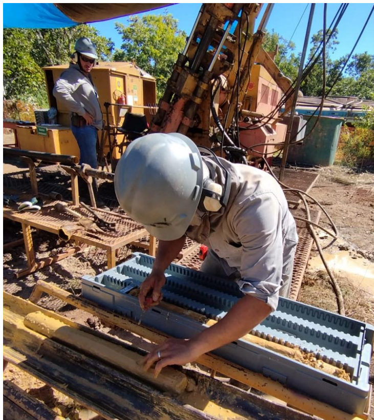
Figure 1: Drilling is underway at the Urubu Prospect