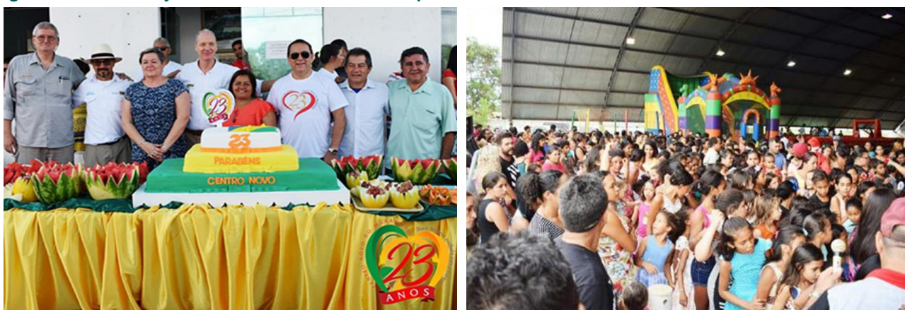
Figure 12: Community Events at Centro Novo and Cipoeiro

The Company also continued to build stronger relations with the local community, sponsoring a Children's Day event with the Centro Novo Education Department, participating in the 23 rd Anniversary of Centro Novo, in addition to sponsoring a health and well-being day with the local government and a children's Christmas party.