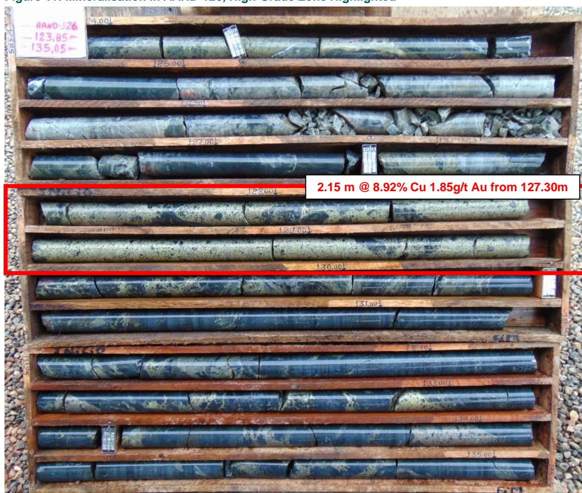
Figure 11: Mineralisation in AAND-126, High-Grade Zone Highlighted

These results 2 are highly encouraging and justify further drill testing. Each hole will now be surveyed by downhole EM, advancing knowledge to the next level before recommencing drilling.