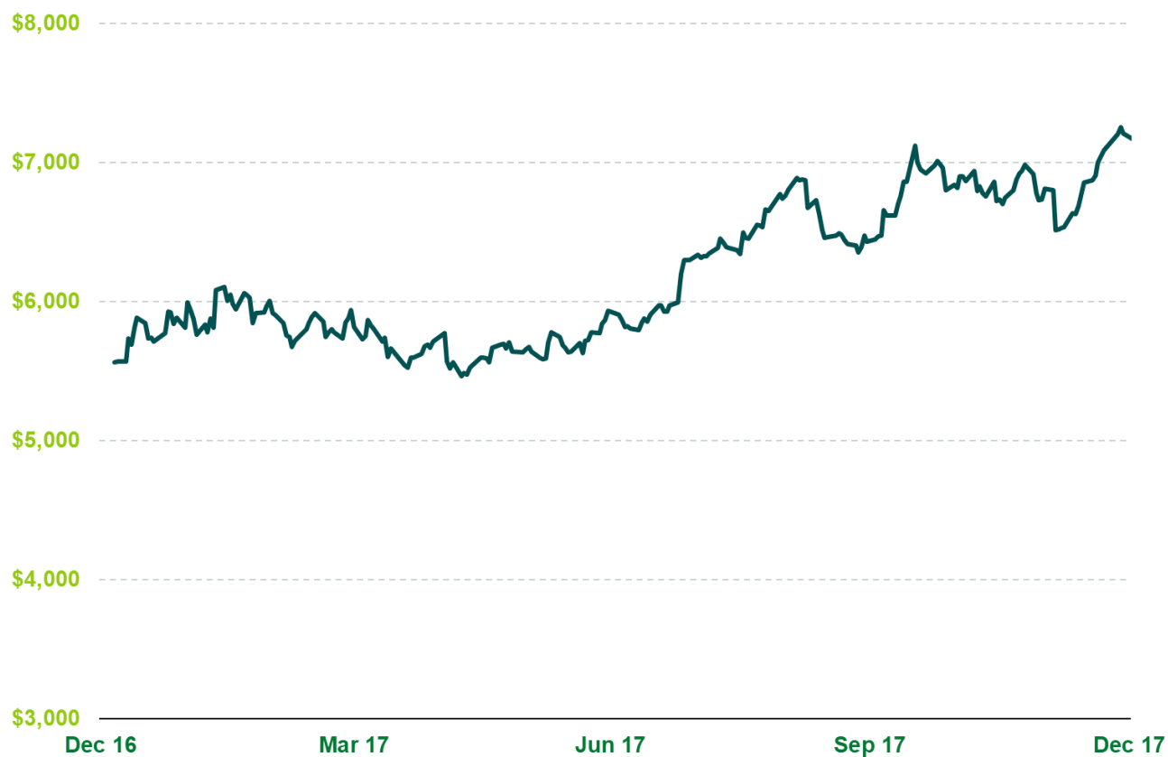
Figure 9: Copper price (US Dollar per tonne), December 2016 – December 2017

The Company has sold forward 2,850 tonnes at an average of $2.90/lb. The Company can reallocate tonnes to months with more favourable pricing.