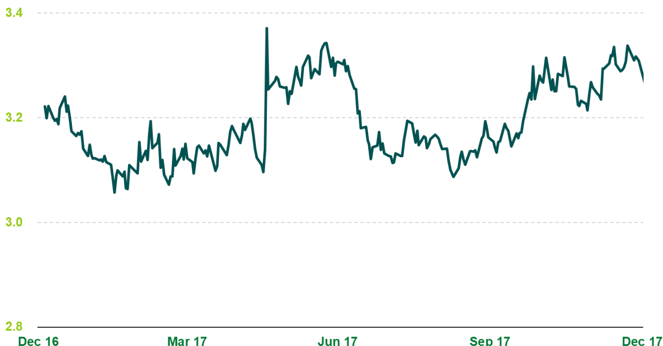
.Figure 7: Brazilian Real : US Dollar, December 2016 – December 2017

Other cost saving efforts being investigated include concentrate haulage, diesel and explosives suppliers.