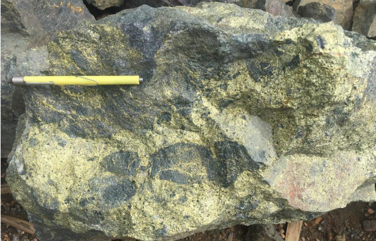
Figure 14: Breccia style high-grade copper mineralisation (chalcopyrite) from Pantera

The Pantera transaction required ratification by the BNDES who retain a royalty interest in the project.