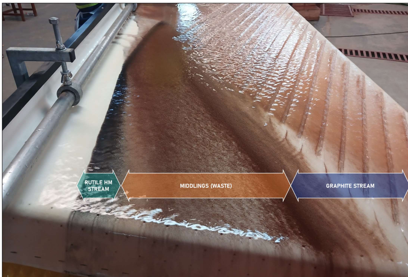
Figure 1: Holman Wilfley 2000 wet shaking table in action demonstrating clear separation between Rutile HM, waste and Graphite

The graphite circuit feed provided to the various laboratories was produced at the Company's existing laboratory facility in Lilongwe, Malawi, where it was screened and separated over a wet shaking table.