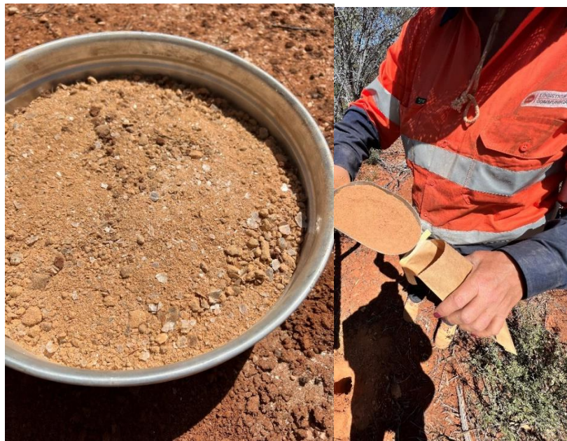
Figure 1 - Geochemical sampling at the Horse Rocks Li Project.

Field mapping has confirmed the historically mapped pegmatites, with further pegmatites identified within the greenstone units.