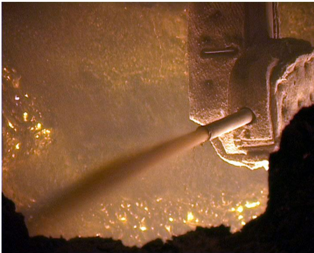
Figure 2: Application of magnesia “gunning mix”.

Leigh Creek magnesite is cryptocrystalline magnesite, which has superior characteristics over macrocrystalline magnesite. The smaller crystal structure and typically higher purity of cryptocrystalline magnesite allow it to produce higher value magnesia products such as high specific surface area (SSA) and high reactivity CCM and high density DBM.