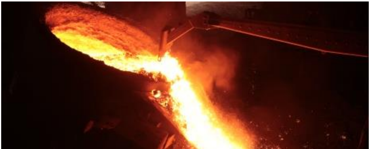
Figure 1: Whyalla Steelworks

A large proportion of the world's steel is made using the Basic Oxygen Steel (BOS) making process (e.g. Whyalla Steelworks) where the molten iron from the blast furnace combined with scrap iron is purified from impurities by blowing oxygen through the molten iron either by lances from the top or by blowing oxygen through pipes at the bottom.