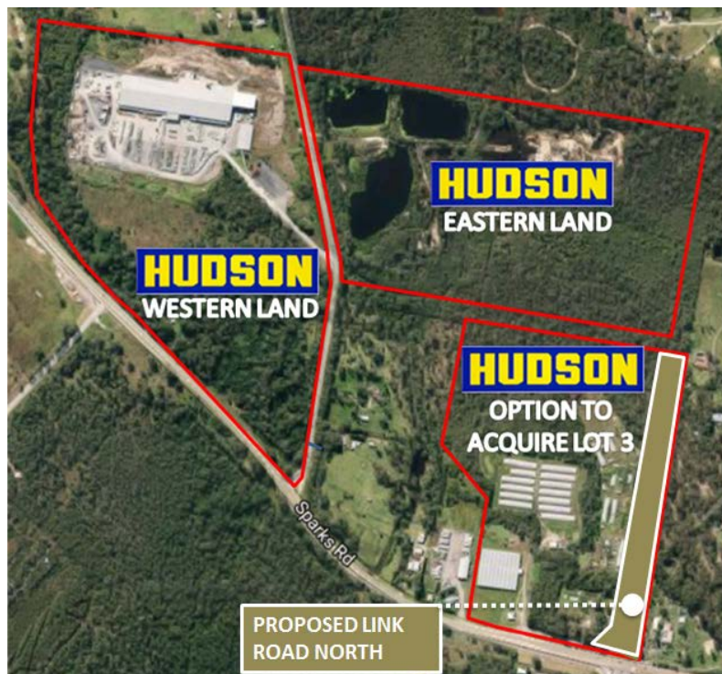
Fig. 1: Hudson Property Diagram