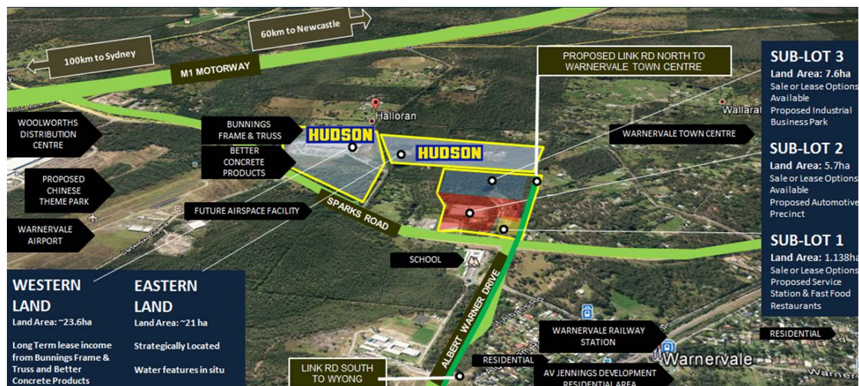
Fig. 2: Hudson Property Location Map

For further information, please contact: