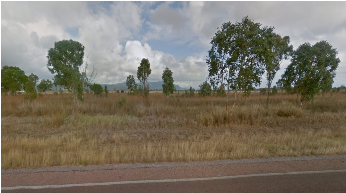
Figure 1 - Woodstock Site

consortium's criteria. Independent engineers, along with key members of the consortium, visited all sites and chose Woodstock as the most suitable location for the battery plant.