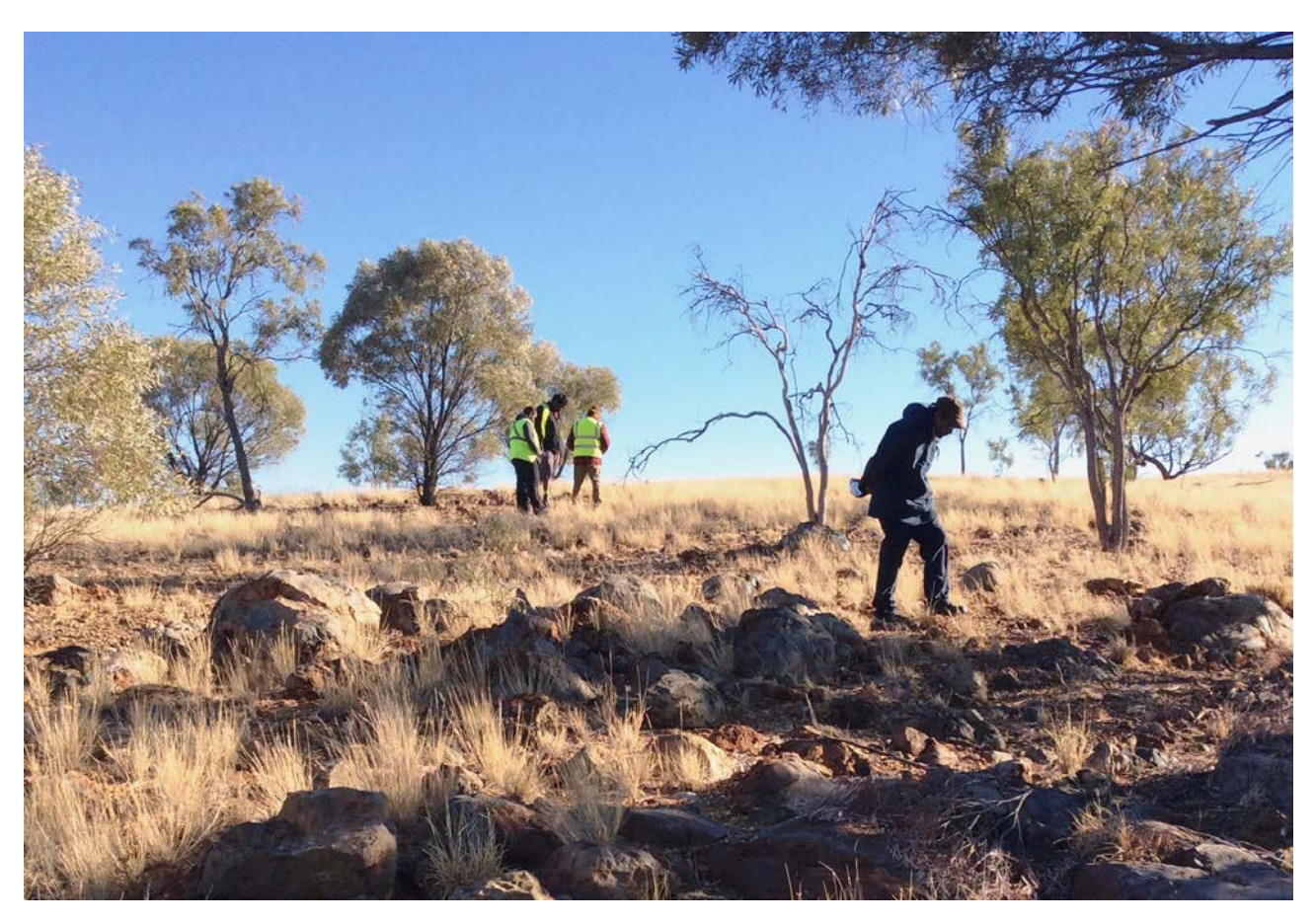
FIGURE: Traditional owner representatives of the Bularnu Waluwarra Wangkayujuru ("BWW") conducting a cultural heritage survey at the Ardmore site.

The results were reported under JORC 2012 and Centrex is not aware of any new information or data that materially affects the information contained within the release. All material assumptions and technical parameters underpinning the estimates in the announcement continue to apply and have not materially changed.