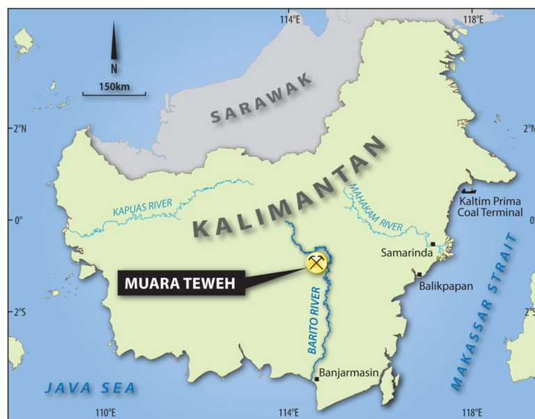
Figure 1: Location Map of BPCI Mine

BPCI has successfully commissioned, mined coal and exported coking coal as such has all permits to conduct its mining business.