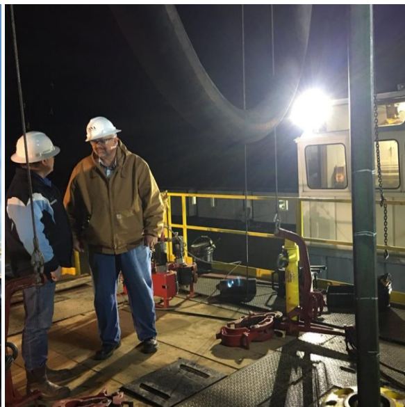
CEO onsite during overnight drilling operations