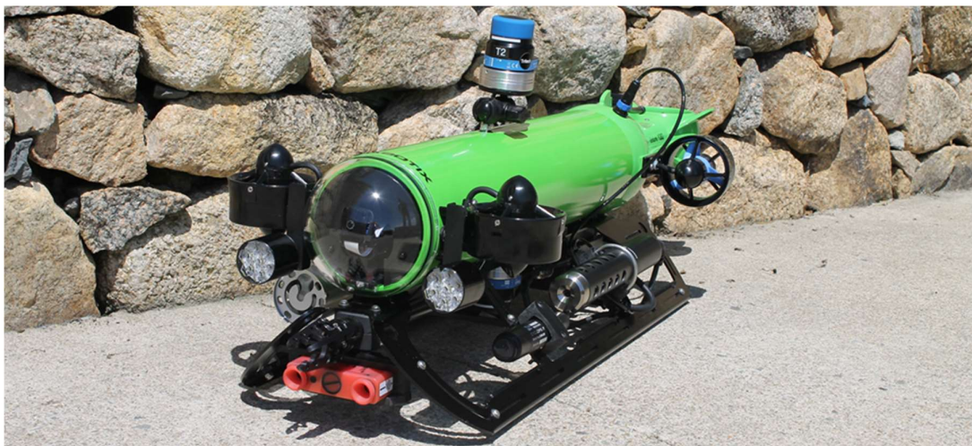
Aquabotix's Endura as delivered to VIMS