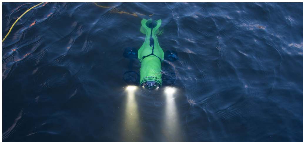
Aquabotix's Endura underwater drone approaching inspecting harbourside infrastructure

Industry consolidation continues with another transaction completed during the quarter, in addition to other recently observed deals involving major players. In particular: