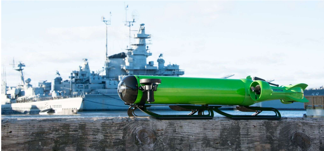
Aquabotix's Endura (long-body) representative of what will be delivered to the US Navy