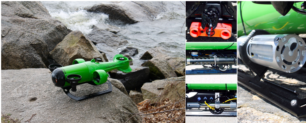
Endura 3 (left) and a range of sensors that have been integrated to the system and installed for recent deliveries, including environmental sensors, laser scaler, grabber arm and water sample collector (right)