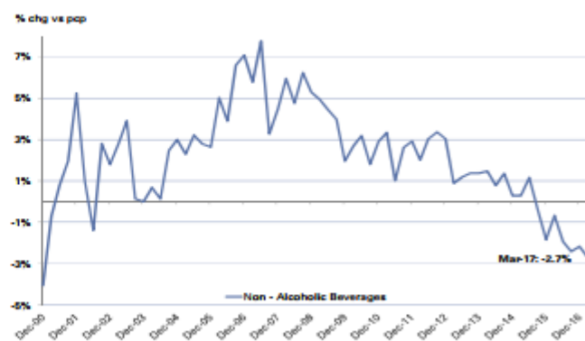
Non-Alcoholic Beverages CPI: %chg vs pcp