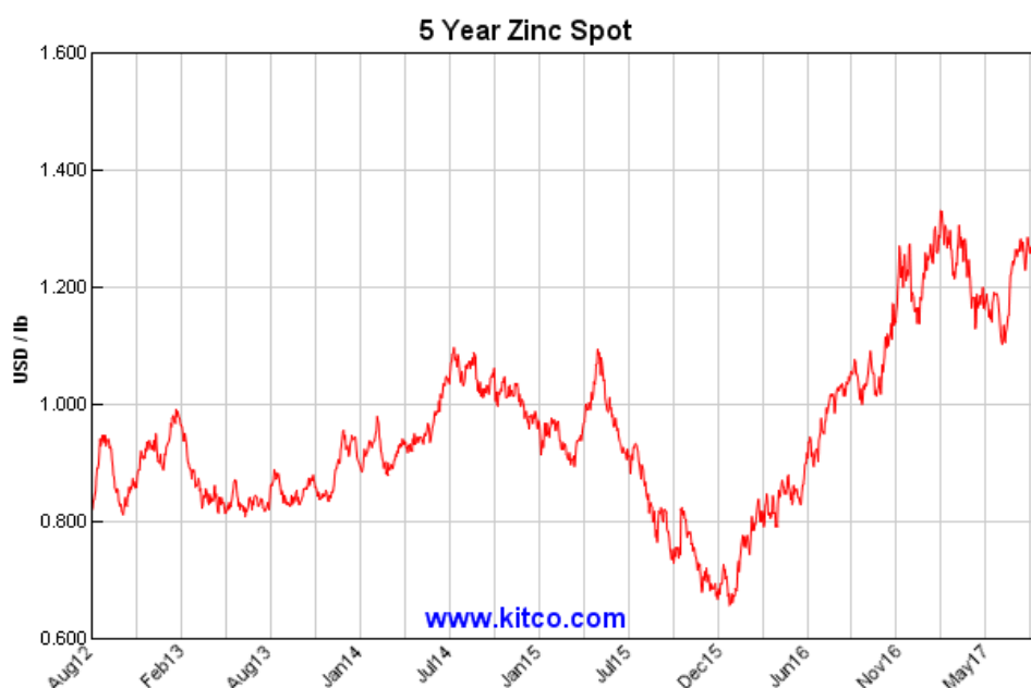
Figure 1: five year zinc spot price - www.kitco.com 29 August 2017

The Company has previously reported the ZZP as containing an 'estimated non-JORC resource of 430,000 tonnes at 14% zinc', based on a view that the available data supported this description. Following discussions with the Australian Securities Exchange, the Company withdraws this resource statement.