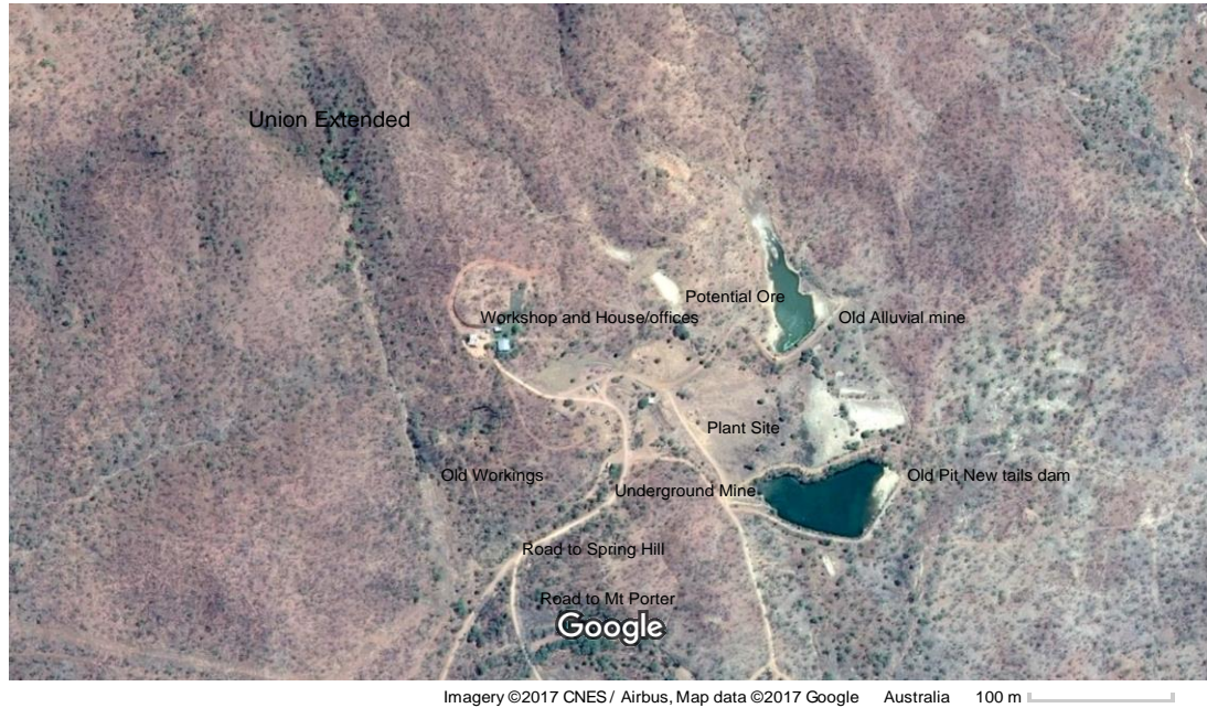
Figure 3: Union Extended Google maps image showing material features.