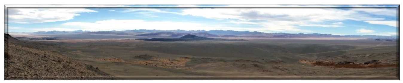
Images of the diamond drill rig at the camp and images of the Kachi project