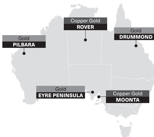
Figure 1: Project locations