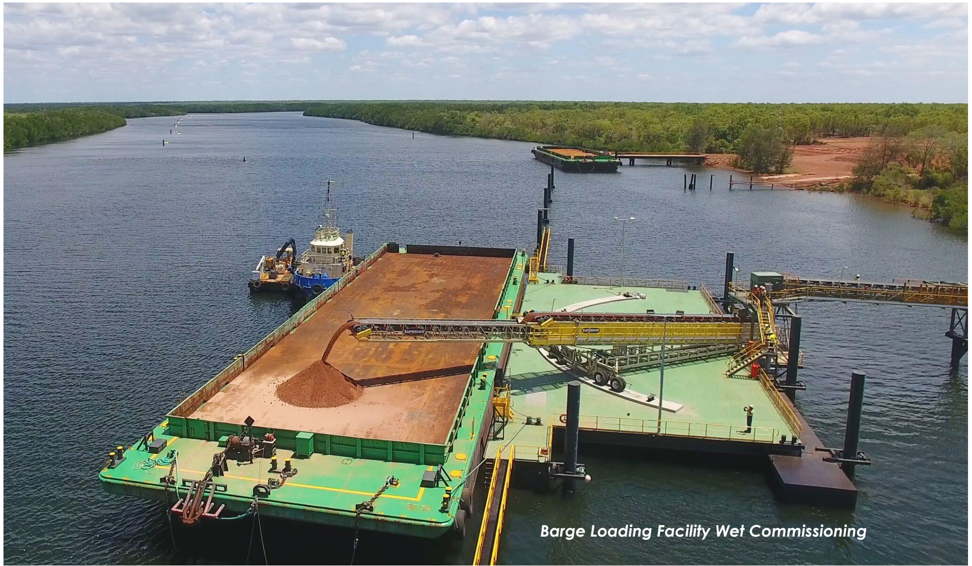
Barge Loading Facility Wet Commissioning