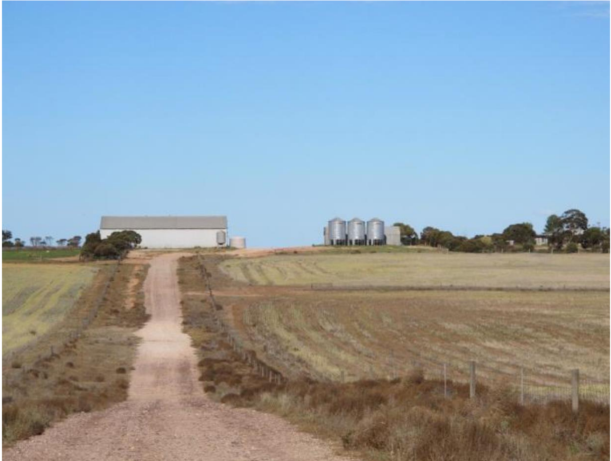
Figure 1: Archer's 100% owned Sugarloaf property and site of Sugarloaf Graphite and Graphene Processing Plant.

The grant of the Mining Tenements, the recent acquisition of the Carbon Allotropes online graphite / graphene market place, the appointment of Mohammad Choucair as CEO and the recent increase in world graphite prices has Archer well positioned to move the Eyre Peninsula Graphite Project to the next stage.