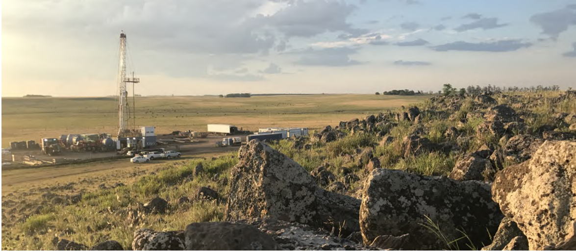
Photo - New Force rig at Cerro de Chaga-1