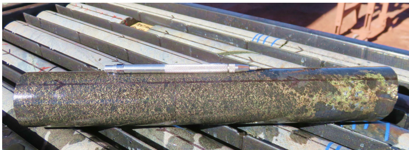
Figure 2: Drill core from DD17KND005 at 140.5m. Magnetite skarn with net-textured and coarse-grained pyrrhotite (bronze coloured) and chalcopyrite (yellow) mineralisation.