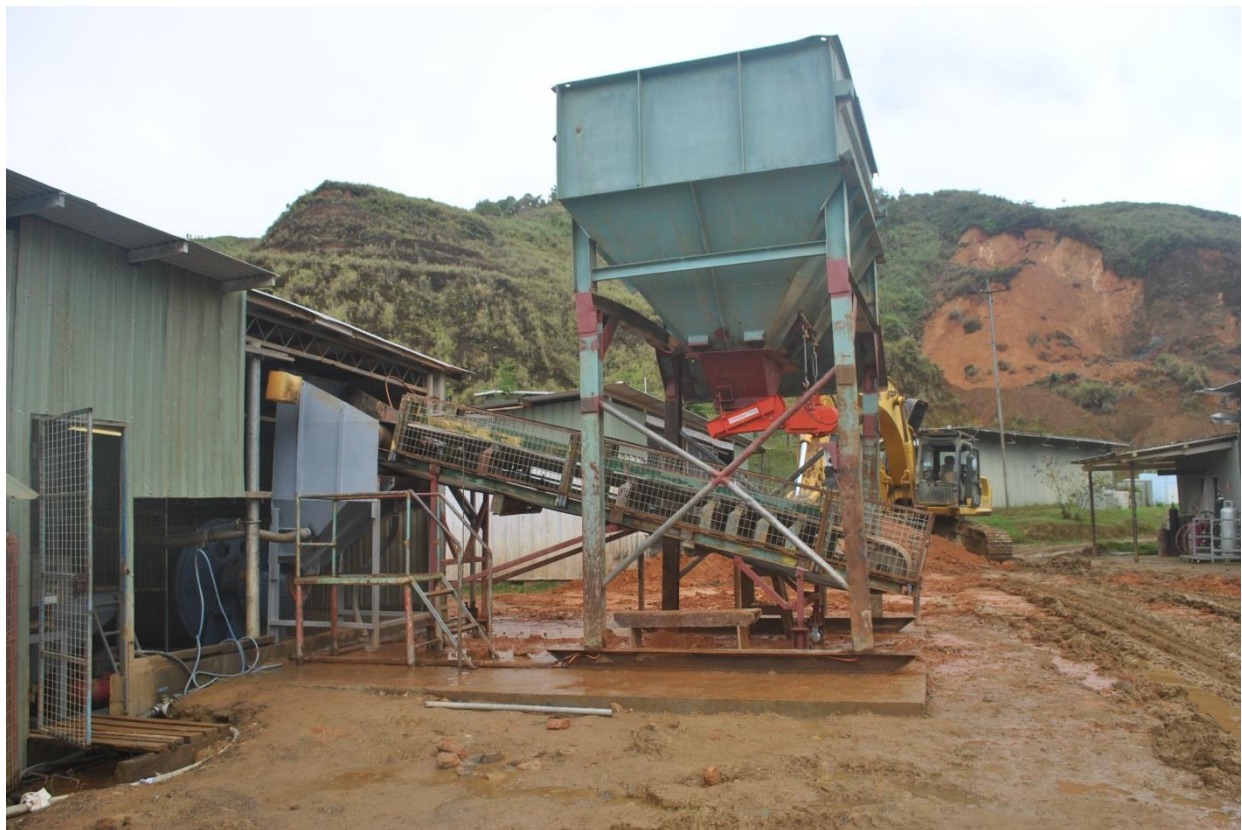
Testing and modifications are continuing on the newly installed mechanical ball mill feeding plant

A decision on a replacement engine will be made in due course, with the purchase of the second D85 from Hidden Valley being a more suitable and cost-effective priority option, which will now be advanced.