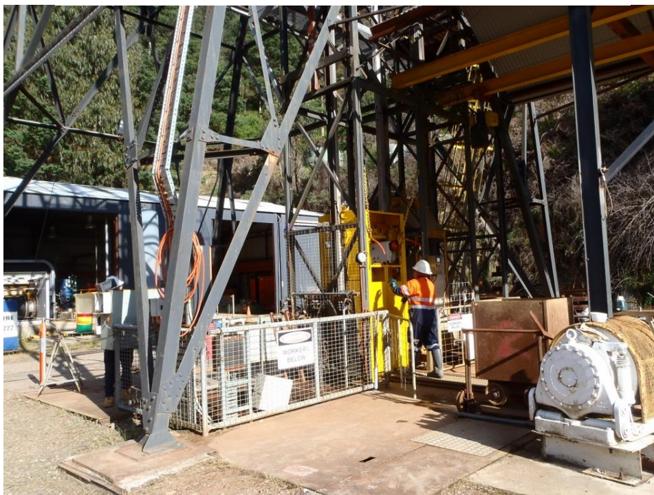
Figure 1. Ore cart being loaded into recommissioned mine cage and shaft

A Mine Manager and a contract workforce have been hired to undertake development on 2 level with access provided from the surface and without the need to utilise the Morning Star shaft. This mine development work is being undertaken on a 7 day, dayshift only roster which requires laying rail, development around the airway and then development to the ore.