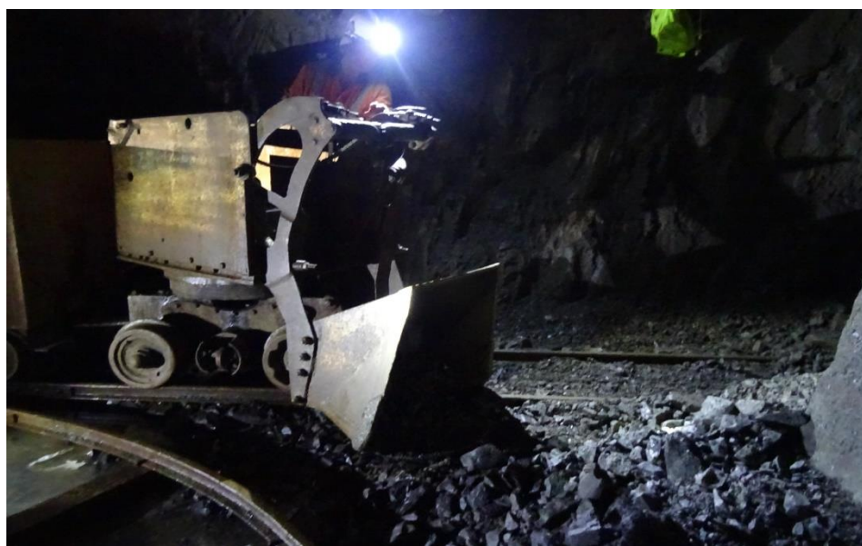
Figure 3. Mining where the miner is "boggie" the fired rock using a rail bopper on 2 Level