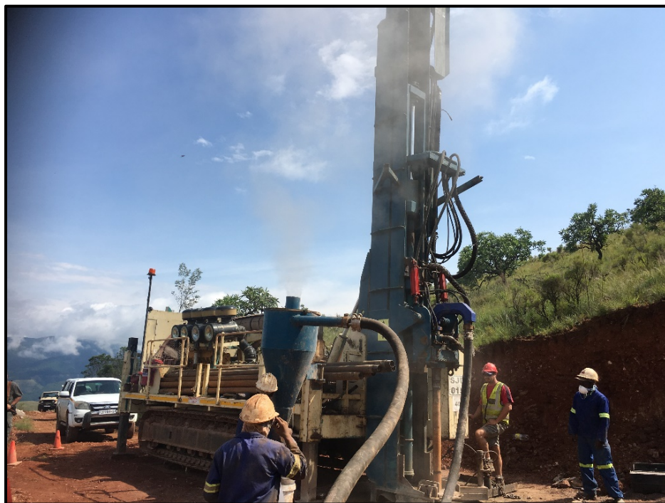
Figure 2) RC rig in operation