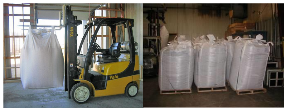
Supersacks of Fertoz products ready for shipment

distributors and build a market and supply chain. The Company further advises that the Buyer is also investigating manufacturing a liquid product line from Fertoz ore.