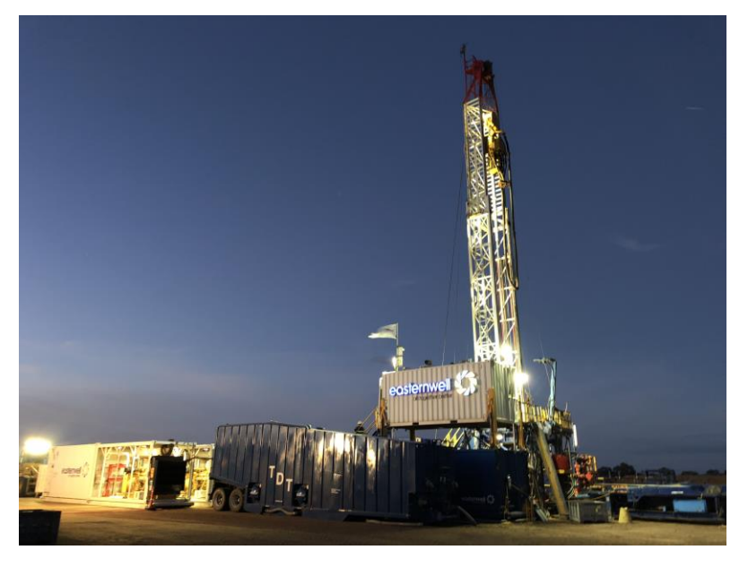
Figure 2 – Rig on Glenaras 10 location

All wells are being drilled off a single pad to reduce construction costs, minimise ground disturbance for landowners and minimise potential disruption from rain events on rig moves. The duration of the drilling programme is expected to be approximately six weeks. The wells will then be completed with horizontal electrical submersible pumps (ESPs) using a separate workover rig, with surface facilities installed thereafter. Production start-up is targeted to commence in early June depending on weather.