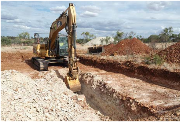
CAPTION: 23 tonne excavator mining shallow ore at Ardmore.

Bulk samples for recent pilot work were obtained from several excavations in the deposit demonstrating the ability to mine the ore without the need for blasting.