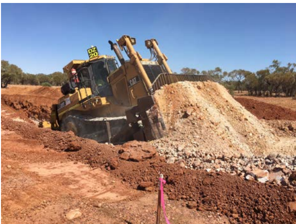
CAPTION: D9 dozer undertaking trial stripping of shale overburden at Ardmore.

Successful dozer stripping trials of the overburden were completed in February 2018. The trials were overseen by dozer stripping experts from MEC Mining with the purpose of providing accurate productivity factors to feed into the Feasibility Study. Not only were productive dozer pushing rates achieved during the trials without the need for blasting, there was also no need for any ripping of the weak shale overburden by the dozer.