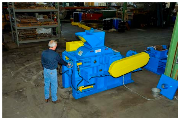
CAPTION: Pilot hammer mill at Williams Patent Crusher & Pulverizer Co. Inc. in the US.

Pilot scale crushing test work in the US showed the ability to reduce the original Scoping Study three-stage crushing circuit design to a single hammer mill given the weak nature of the material.