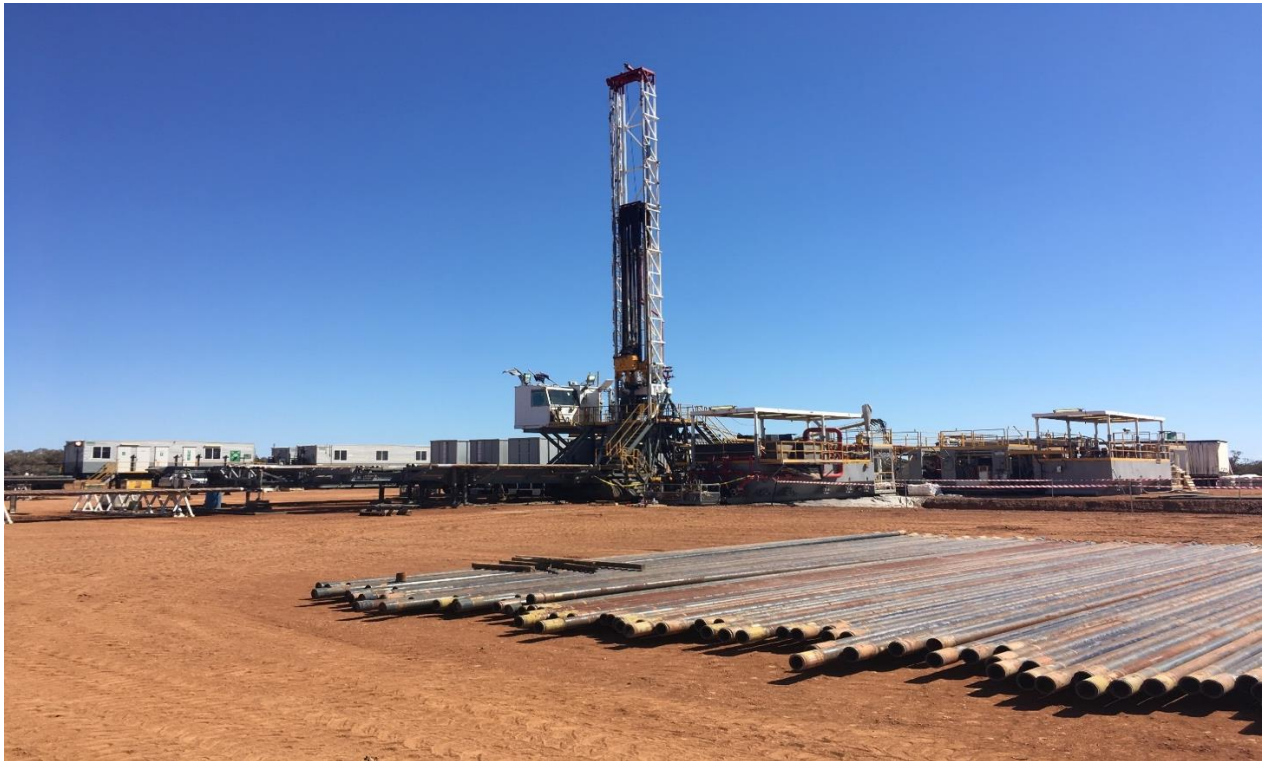
Ensign Rig 964 on the site of Tamarama-2.

The well was drilled to the depth of 710 metres RT (below Rotary Table) and surface casing was run and cemented to 708 metres RT. Current operations as at 6.00 am on 16th April 2018, are pressure testing the Blow Out Preventers prior to drilling out the production hole.