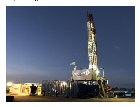
Figure 2 - Rig on Glenaras 10 location

All wells are being drilled off a single pad to reduce construction costs, minimise ground disturbance for landowners and minimise potential disruption from rain events on rig moves. The wells will then be completed with horizontal electrical submersible pumps (ESPs) using a separate workover rig, with surface facilities installed thereafter. Production start-up is targeted to commence in early June depending on weather.