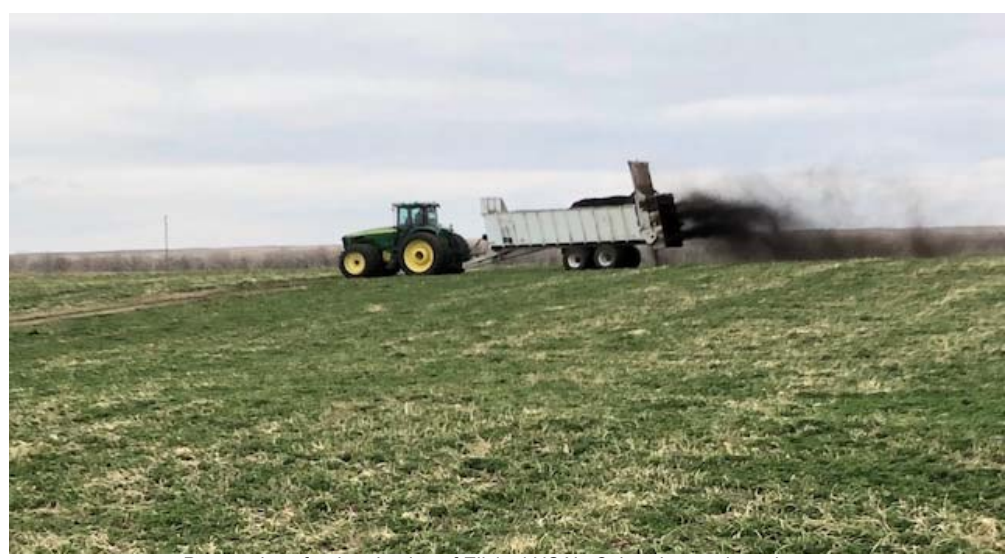
Preparations for the planting of Elixinol USA's Colorado crop have begun

These new cultivation activities are being implemented in parallel with Elixinol USA's Manufacturing Supply Agreement with Colorado Cultivars USA LLC (Colorado Cultivars) which has been renewed for a further 12 months. The agreement requires Colorado Cultivars to supply Elixinol USA with a minimum amount of organic hemp flower in monthly instalments up until October 2019.