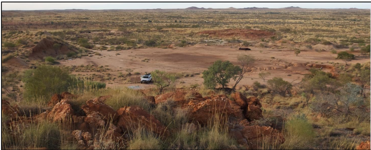
Photo: Outcropping pegmatites at the Moolyella project

Monax intends to seek further projects in the Battery Metals space and is currently reviewing several new opportunities.