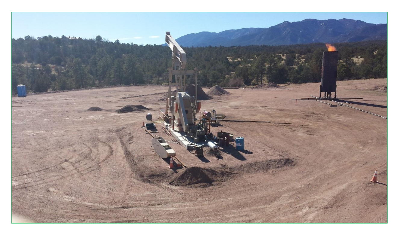
Figure 1: Pathfinder horizontal well flow testing and flare from the Niobrara Formation