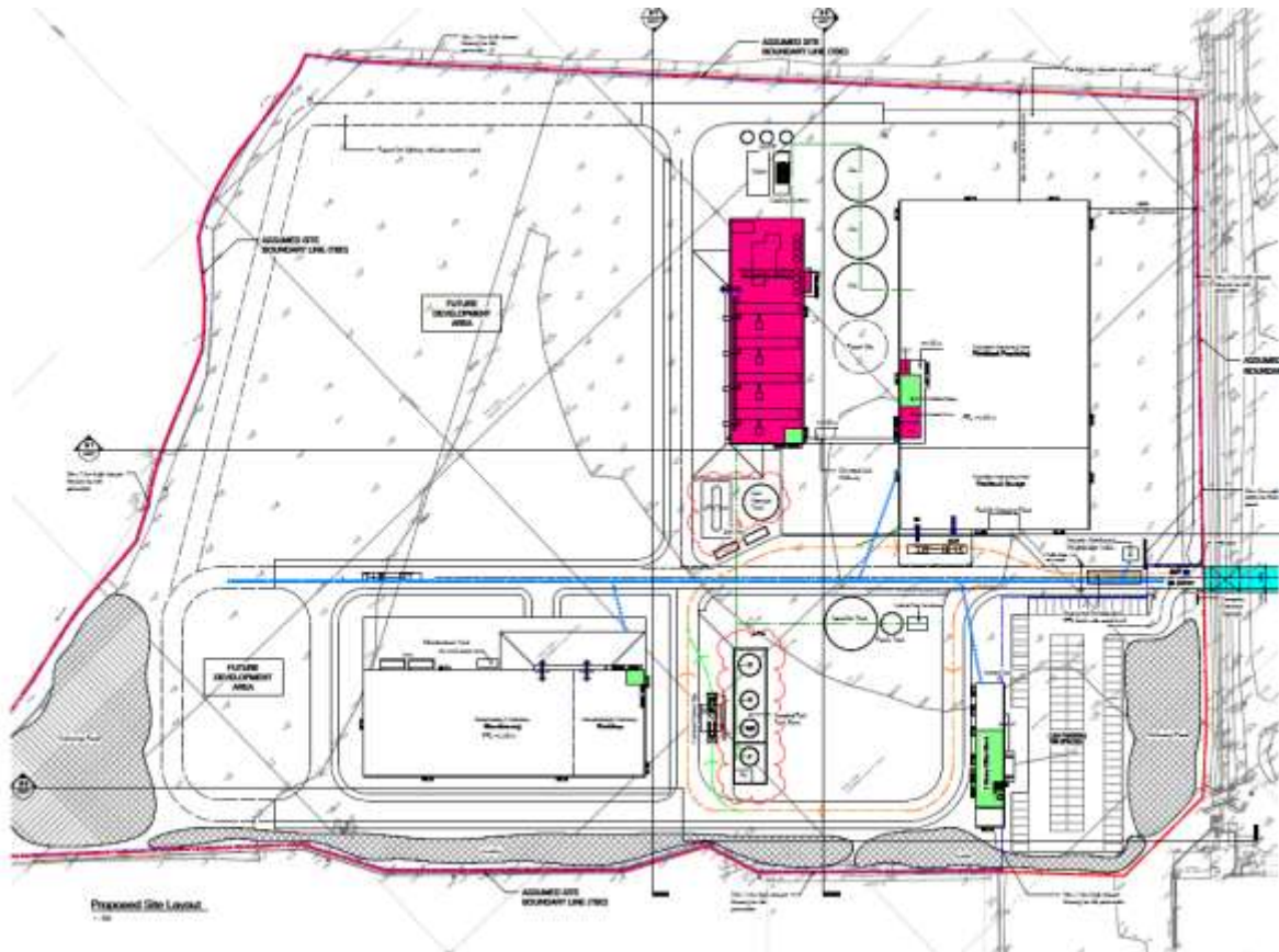
Proposed site plan for the 200TPD facility in Grimsby

The board of directors look forward to providing you with further updates as the project progresses.