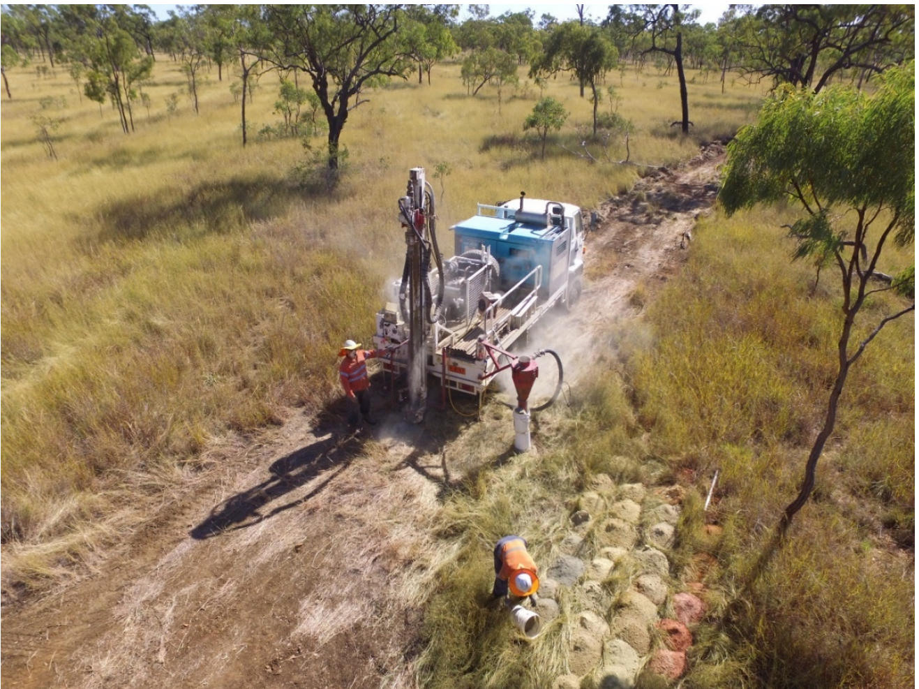
Figure 4. RAB drilling on a localised high cobalt-in-soil survey zone, RAB grid line 1400N.