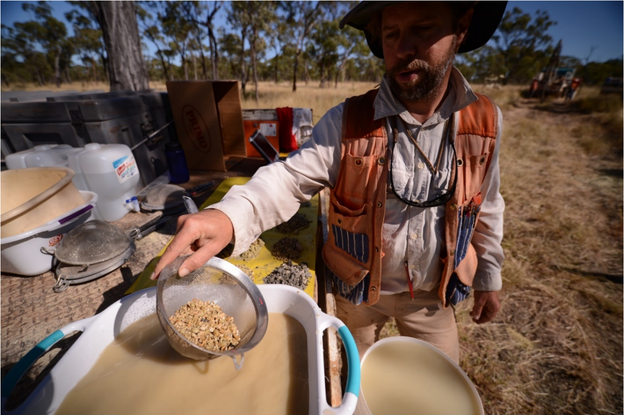
Figure 5. RAB drill chip logging, RAB grid line 1200N.