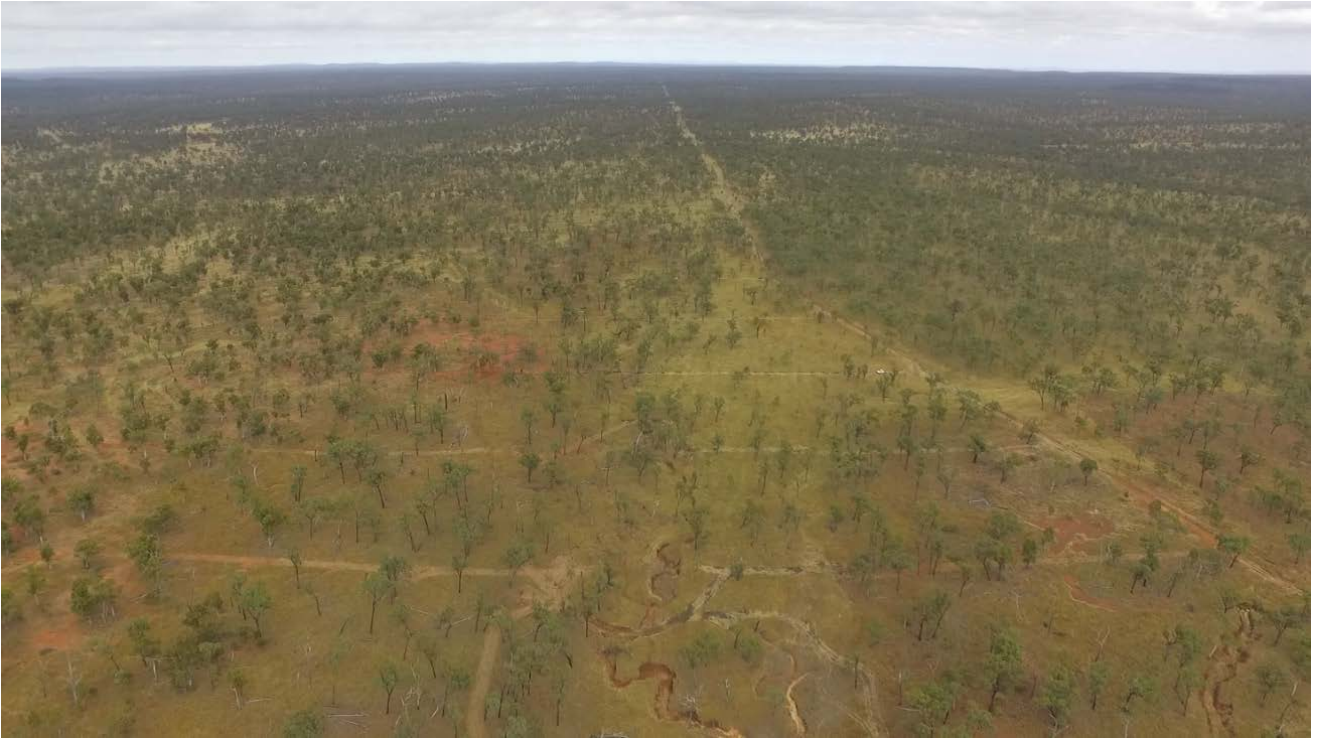
Figure 3. Aerial view of the south western half of the Lucky Creek Prospect RAB drilling grid.