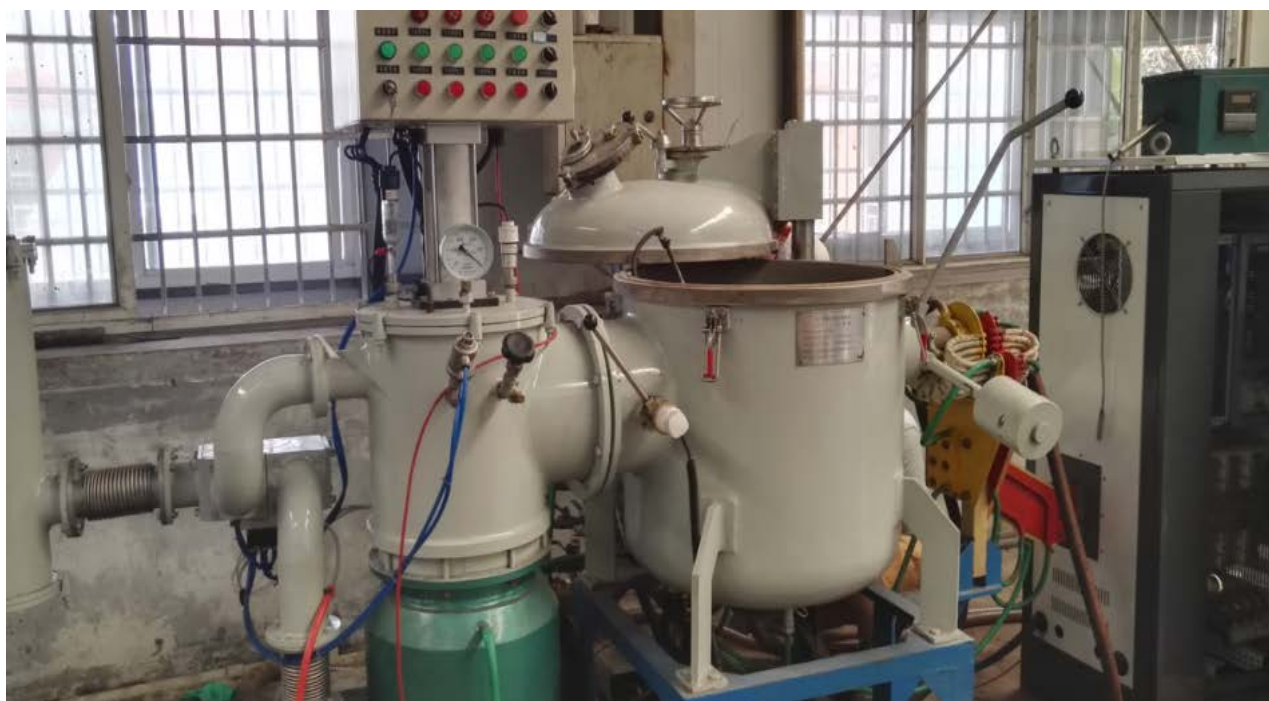
CAPTION: Electric induction furnace used in Oxley trials.

Both EAF and induction roasting trials were completed by WUST. An initial 1 hour, 12kg submerged EAF trial was completed using a 50kW DC unit, showing overall 83% potassium extraction from the Oxley ore. The target temperature of 950 degrees C was far exceeded in the trial due to the large size of the electrode (7cm, graphite negative electrode) relative to the charge volume of the feed (26cm diameter graphite crucible, positive electrode) given the constraints of the laboratory scale furnace setup. This caused higher than anticipated volatilisation of the salt, reducing the reaction potential. Further optimisation trials to improve on the already encouraging extraction rate would require an industrial scale unit with a much larger charge feed volume to electrode ratio, where the roasting temperature can be better controlled to the desired target range. The test work however showed that the EAF has potential for use in the process design.