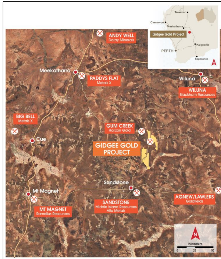
Figure (1): Gidgee Gold Project Location Plan