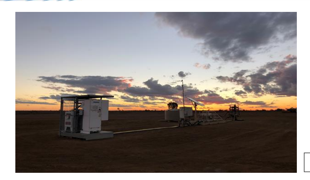
Figure 2 – Glenaras 10L lease

It is expected that the Placement shares will be allotted by Thursday, 19 July 2018. The Placement shares will rank equally with the Company's existing securities.