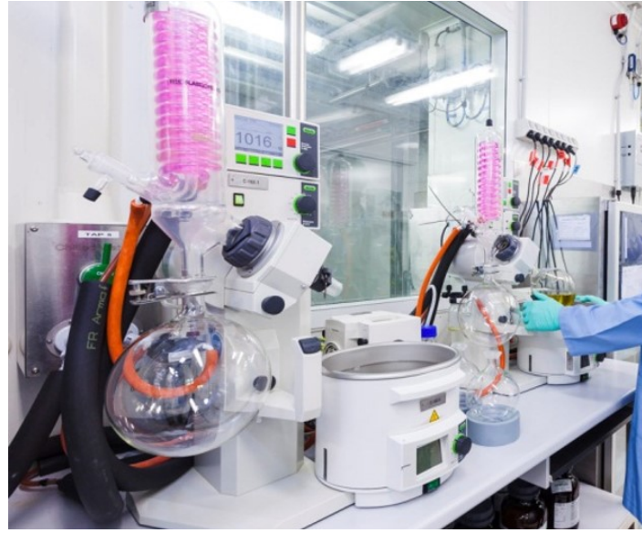
THC's Southport Manufacturing Facility (1)