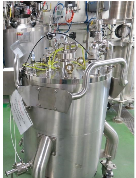
THC's Southport Manufacturing Facility (3)