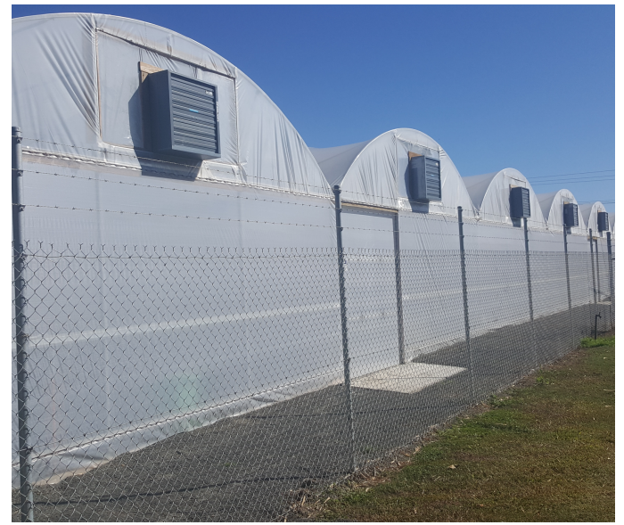
THC's Bundaberg R&D and Cultivation Site