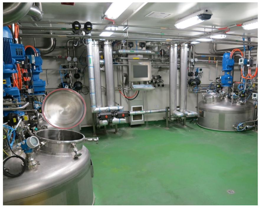
THC's Southport Manufacturing Facility (2)