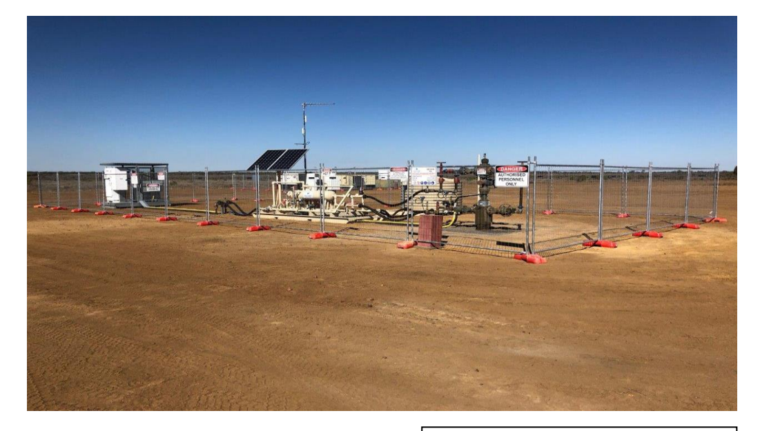
Figure 2 – Glenaras 10L wellsite