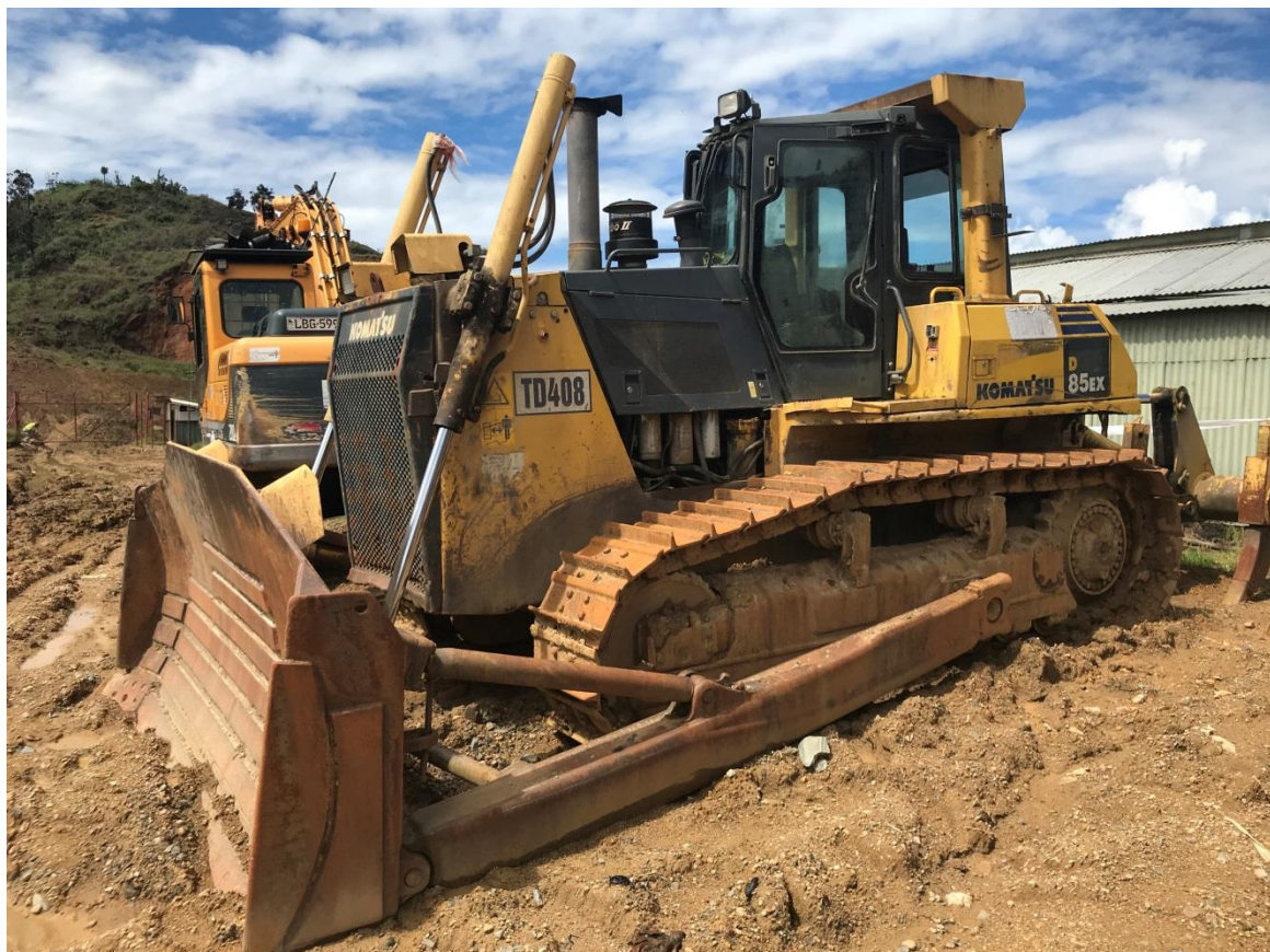
One of the 2 Komatsu D85 bulldozers delivered from Hidden Valley during the Quarter.

Delivery was taken of two second-hand Komatsu D85 bulldozers and a 40t Komatsu HM 400 articulated tip-truck with the rebuilding of the Komatsu D65 bulldozer engine nearing completion, adding significant capacity to the mining operations going forward.