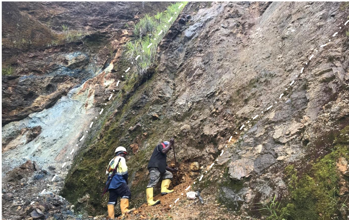
Newly discovered 7m wide quartz vein in the Karuka stock-work area.

Following recent further field work and drill-hole planning by our geological team in the Enterprise-Karuka diatreme/stock-work area, a significant new 7m wide quartz limonite sulphide vein structure ( including 2m puggy clay shear on the hanging wall) was discovered (pictured below). This vein is thought to be the south-bounding structure of the Karuka stock-work zone which is estimated to be approximately 100m wide. Samples have been taken and will be sent for assay in the immediate future.