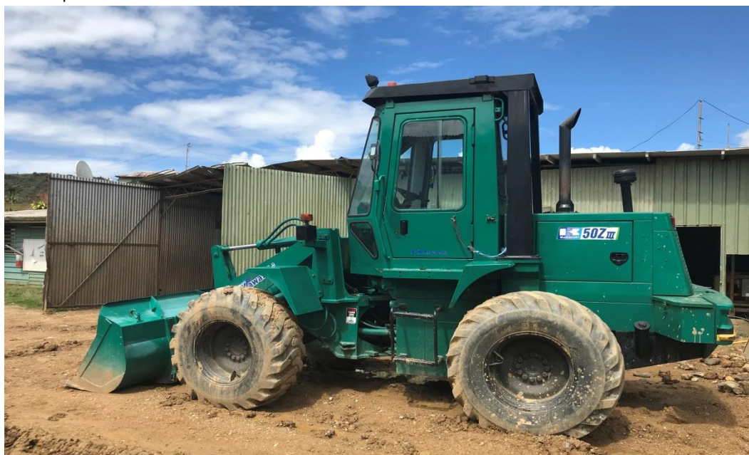
Newly arrived Kawasaki loader at Edie Creek

The mine is currently ramping up the quantity of material mined and processed to the targeted 40-60 tonnes per day as commissioning and test-running of the new feeder and material feed set-up is carried out, and the new mobile mining equipment is put into operation.