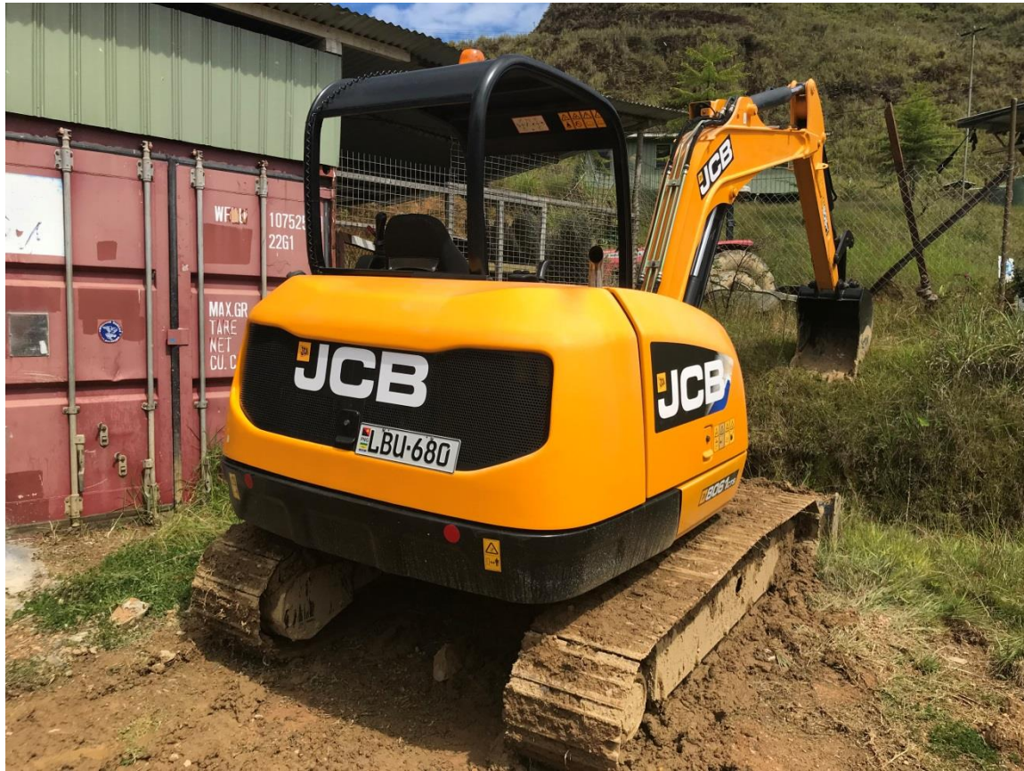
6 tonne JCB excavator at Edie Creek

In addition, the Company completed the funding and acquisition of a new 6 tonne excavator and a second-hand Kawasaki wheel-loader, which were delivered to site subsequent to the Quarter-end.