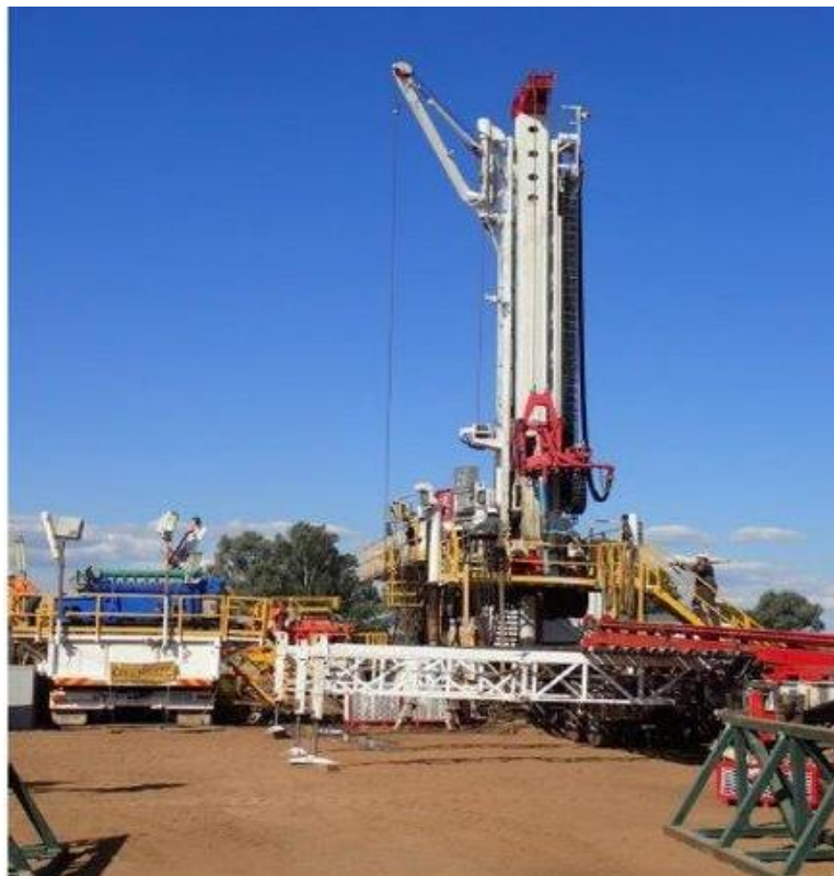
Figure 1 – Silver City Rig 20 successfully drilled the Mira 6 single lateral well in 2017.

Drilling is expected to commence mid to late September, with the drilling work programme to be completed by November/December 2018. Once each of the wells is completed, and surface equipment is installed, production testing will commence.