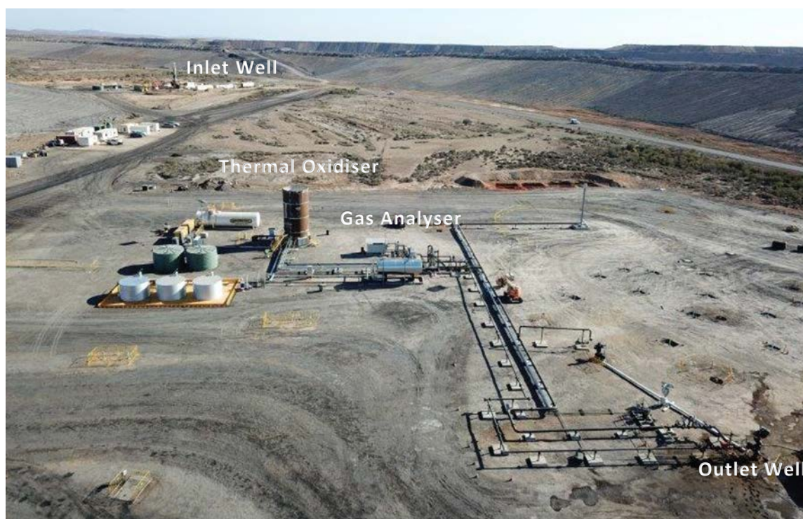
Final configuration of Pre-Commercial Demonstration plant