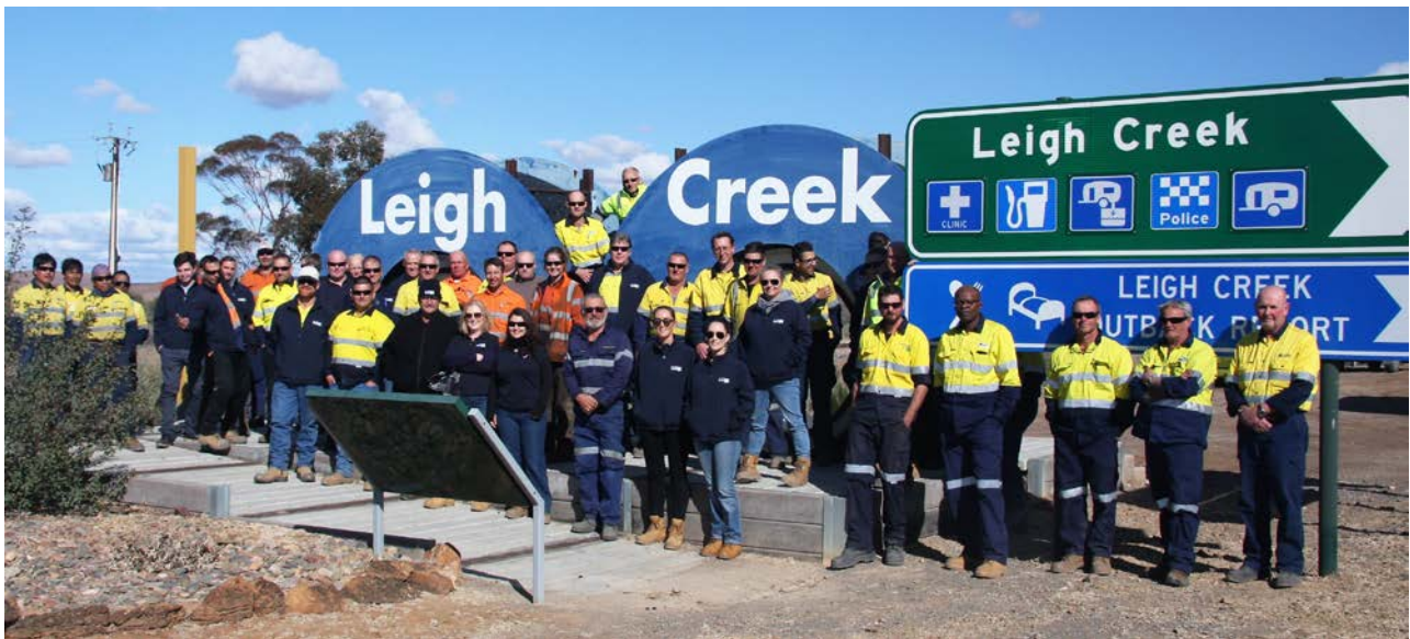
LCK Construction and Drilling personnel

With on-site construction and drilling activities complete, and receipt of the AN for Operations, the PCD is being prepared for operations and the production of syngas. At this stage, initiation and commencement of syngas is expected to commence within quarter 3 2018.