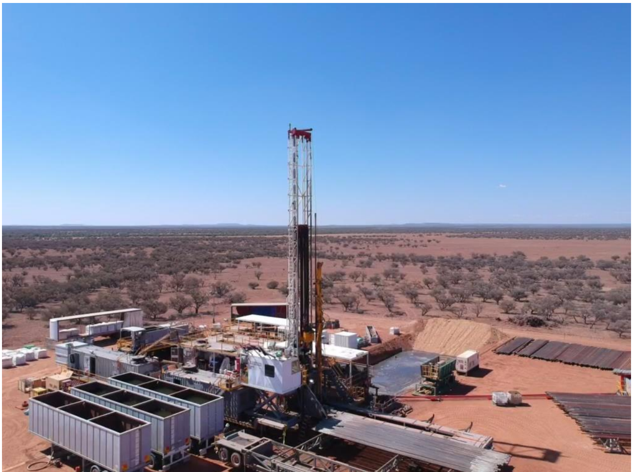
Ensign Rig 964 on location.