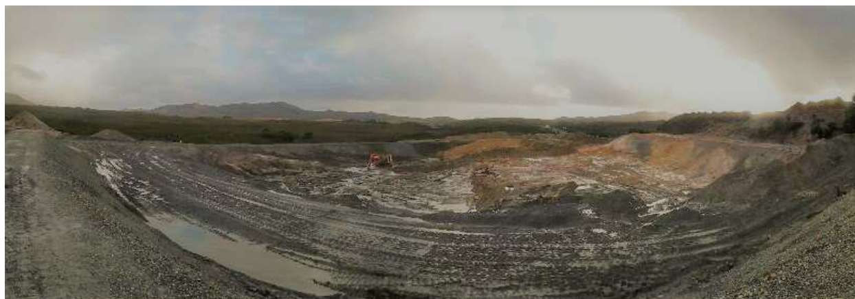
Figure 3 - New Tailings Storage Facility under construction