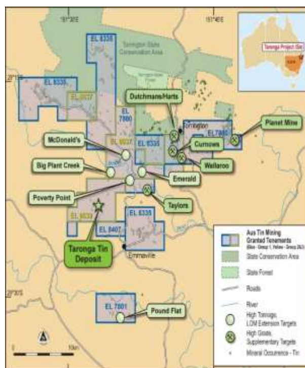
Figure 2 - Aus Tin Mining (NSW) exploration tenure (as at 30 June 2018)

During 2017/18 the Company was granted two exploration licences within the Taronga project footprint (EL 8637 and EL 8639) over an area that it considers prospective for the lithium bearing mica mineral, zinnwaldite 4 . The Company has identified at least three locations close to the contact of the Mole Granite where historic mining activities coincide with reported presence of zinnwaldite. The Company currently holds exploration licences totalling approximately 350km 2 ( Figure 2 ) in one of Australia's oldest tin fields with reported historic production of 88,000 tonnes of contained tin.