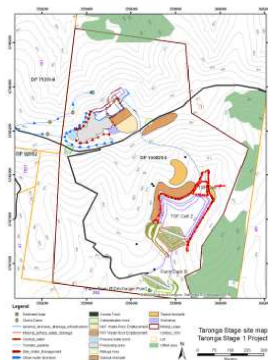
Figure 1 - Provide updated figure of Stage 1 Project area

During the last quarter of the year the Company undertook preliminary ore ore-sorting test work which indicated that ore sorting is effective for Taronga ore. Analytical results for the standard static test indicate an overall 54 percent increase in head grade (0.56%Sn to 0.86%Sn) whilst achieving 96 percent tin recovery. The Company will accelerate the next stage of test work and subject to the outcome of proposed bulk test work the Company may consider incorporating ore-sorting for the Stage 1 Project.